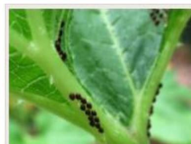
Squash bug eggs