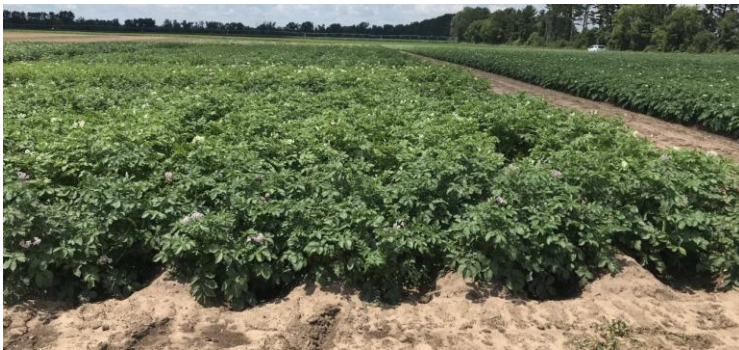
Figure 1. (Left) Russet Burbank and Soraya planted on April 19 th at HARS have both achieved full canopy cover as of June 28 th .

Firstly, some updates on my knee surgery: after six weeks of recovery, I can gradually get back to normal field trips. Hope you see people out in the field in the near future. As of June 28 th , all varieties (Russet Burbank, Snowden, Soraya, Colomba, Silverton, Plover Russet, Dark Red Norland, Red Prairie) that we planted at HARS has achieved flowering and full canopy closure (Figure 1). My group dug tubers from Russet Burbank and Soraya, and found that all plants had tubers, and most tubers were smaller than 1oz (Figure 2).