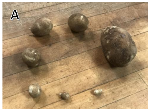
Figure 2. (Right) Most tubers from Russet Burbank (A) and Soraya (B) were smaller than 1oz as of June 28.