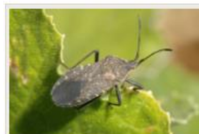
Squash bug ( Anasa tristis )

Potato leafhopper (PLH) numbers continue to develop in green bean, hops, alfalfa and potatoes. Chemical insecticides provide the most effective control of PLH. Seed treatments and at-plant systemic treatments applied to control other insect pests have been shown to give excellent control of PLH. Many foliar insecticides also provide excellent control for PLH. The selection of foliar insecticides should consider control of multiple pests.