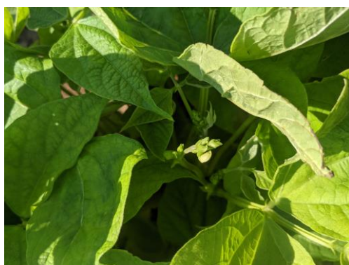
Figure 3. Kidney beans showing flower buds as of July 1. Planted date was May 24 and most plants are at V7-V8 stages.