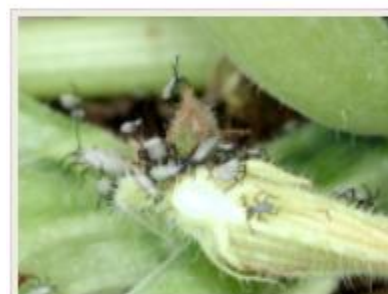
Squash bug nymphs